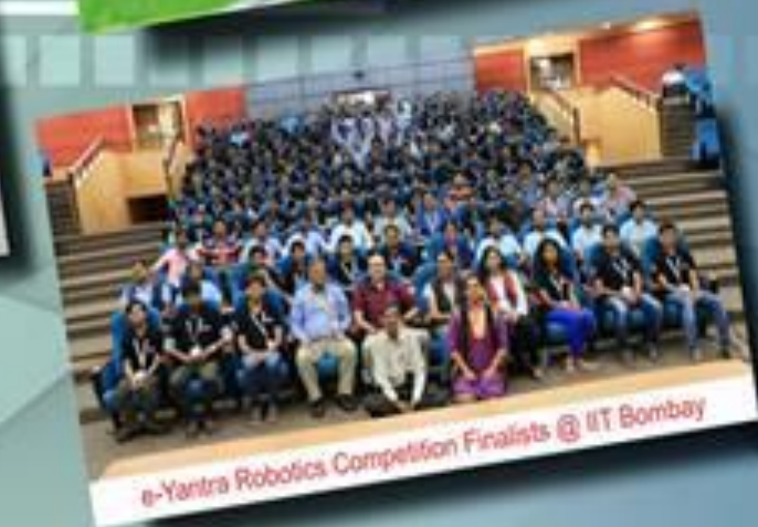
e-Yantra Robotics Competition Finalists @ IIT Bombay