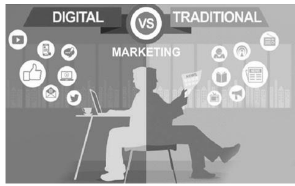
Figure 3. Platform of Digital Marketing vs Offline Marketing

In digital marketing, the company can make the target on various kinds of platforms such as Social Media, SEO, PPC, Google ads, etc. While Offline marketing can make target some markets, to prepare a new and old client list, to catch up with luxury brands or markets. It is a long process and to