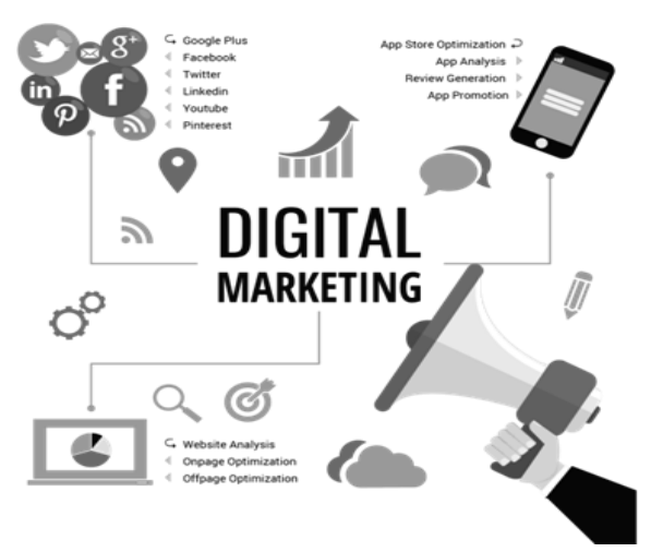
Figure 1. Digital Marketing

technologies such as mobile commerce, electronic funds transfer, supply chain management, Internet marketing, online transaction processing, electronic data interchange (EDI), inventory management systems, and automated data collections system. Nowadays, Digital Marketing plays a huge and important role in marketing. Digital Marketing is a fast process, less physically power efforts and timeconsuming. e-Commerce can provide multiple comfortable zones to the customers in the form of availability of goods at a lower cost, wider choice and saves time. Ecommerce is showing enormously business growth in India. Customer feedback can play a major role in both marketing Digital Marketing and Offline Marketing. The success or best result of Digital Marketing is depending upon its popularity of e-Commerce customers, its branding images, its unique and fair policies of e-Commerce sites and customer relations, etc. Digital marketing is simple procedures and a friendly user than Offline marketing.